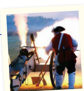
Lewis & Clark State Historic Site